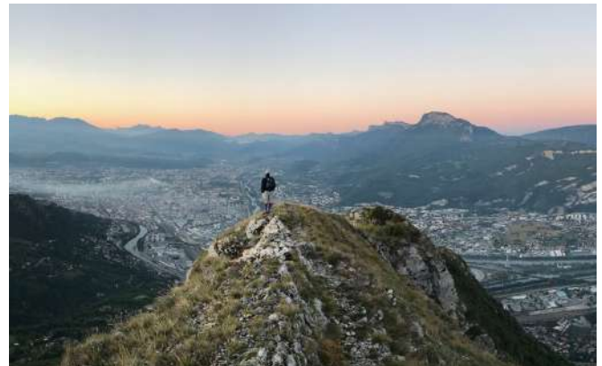
Grenoble - International city of technology, science, and business located in the heart of the French Alps

* Contingent on global conditions and travel restrictions